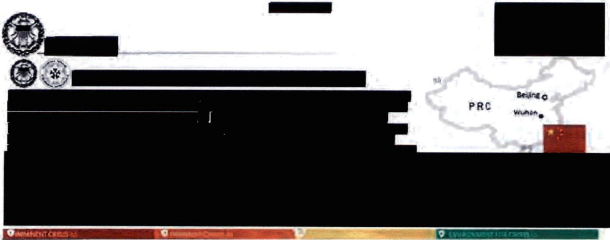
Fig. 4: [REDACTED]

The next day, briefing slides for the Secretary of Defense and the Chairman of the Joint Chiefs of Staff include an item noting [REDACTED] 99