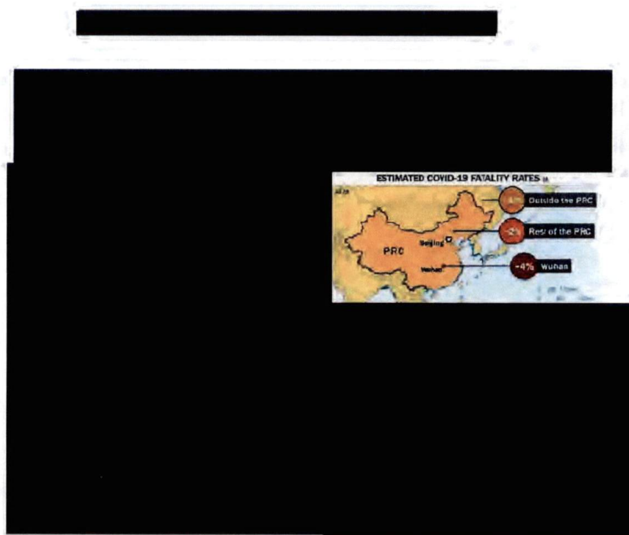
Fig. 8: [REDACTED]

By this point, the die had been cast – COVID-19 had come to the United States. It would soon disrupt our national life and kill thousands of Americans. It was only a question of how bad the crisis was going to be – and whether the government would take steps to prepare Americans for what they were about to face.