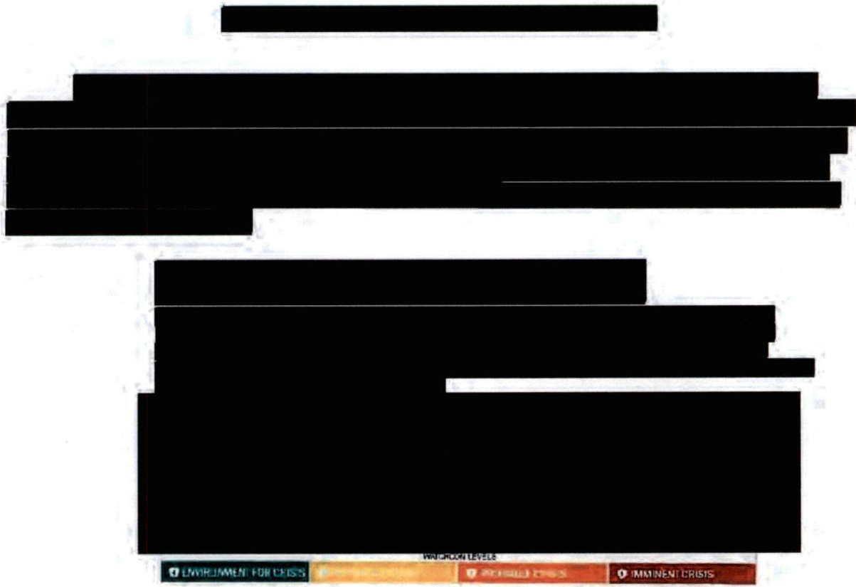
Fig. 3: [Redacted]

The WATCHCON has four levels associated with it: Level 4 (Environment for Crisis); Level 3 (Potential Crisis); Level 2 (Probable Crisis); and Level 1 (Imminent Crisis). 69 [Redacted]